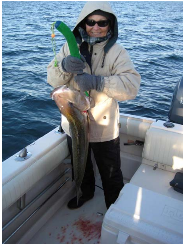
Third fish of the day was Chuck's big Golden Tile. Coming over the side: