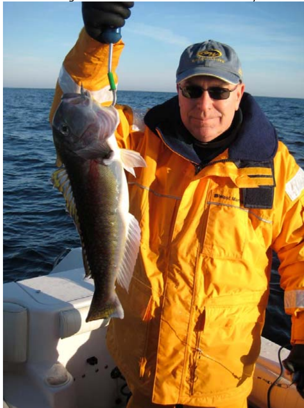
Cathy's Golden - the second fish: